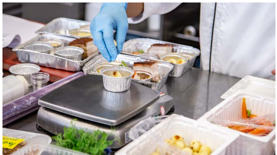
In order to standardise menus, example dishes are plated up.

It is definitely digital. In our view, ConnectedCooking, the networking solution by RATIONAL, has already made a good start. Our combi-steamers and VarioCookingCenter® units are already networked. We are also working with RATIONAL to further develop the system in accordance with our needs.