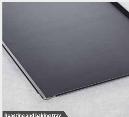
Roasting and baking tray