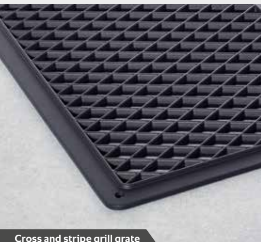
Cross and stripe grill grate

For further information, please request a copy of our accessory catalogue. Or visit our website at www.rational-online.com .