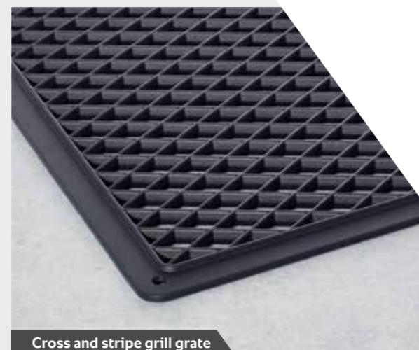
Cross and stripe grill grate