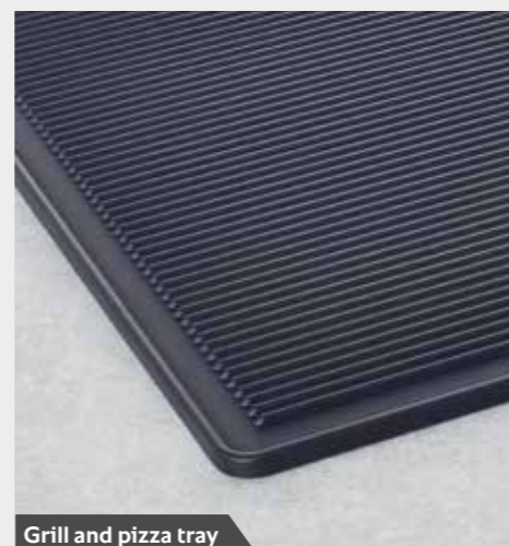
Grill and pizza tray