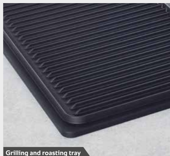
Grilling and roasting tray